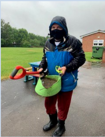
A soggy Mr Leader

The extreme wet weather on our planned 'Go Green Day' didn't stop the staff and children getting involved in some sprucing up of our outside areas. Thankfully the weather improved the following week and the classes were able to get outside and tidy up the outside areas. We litter picked, trimmed and cut back some of the over-grown areas. We hope that you have noticed that many of the planters and pots have been replenished with fresh soil and attractive perennials and grasses.