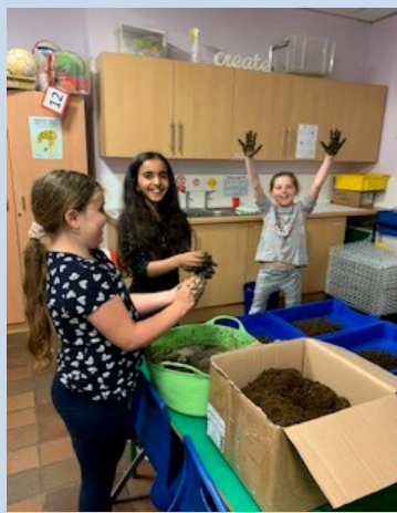
Making seed balls