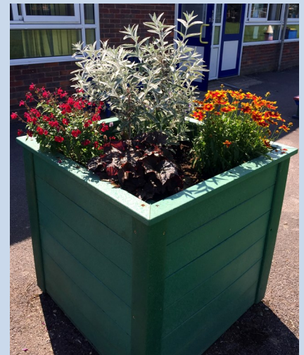
Our beautiful planters