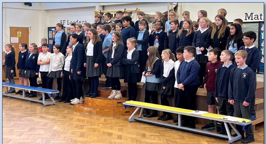
The Year 5 choir loved performing a selection of Carols.