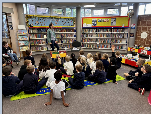
Year 3 enjoyed their visit to Didcot Library

Year 3 have enjoyed their topic on Heroes and Villains. At the beginning of the term a group of fire fighters and ambulance workers came into school to talk to us about their jobs, we were able to look at the amazing equipment that they use each day. The children wrote a thank you letter as recognition of the valuable work they do. In writing we have worked on descriptive paragraphs using adjectives, verbs and adverbs and in Maths we have been learning about addition, subtraction, multiplication and division. Our Science lessons have been fascinating as we have studied how muscles help us to move. We have also learnt about different food groups. In PE we have practised balancing and we learnt how to do a teddy roll and a bunny hop. Outside we have loved learning all about the game of rugby.